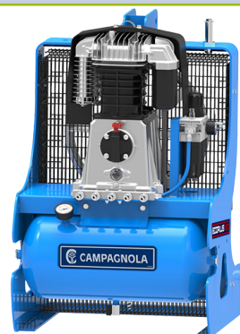
ECOPLUS 520 & 950